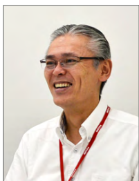
Teijin Limited IT Planning Office, Corporate Planning Headquarters Director