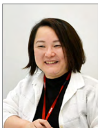
Teijin Limited IT Planning Office, Corporate Planning Headquarters Section Chief