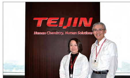
Teijin Limited IT Planning Office Corporate Planning Headquarters